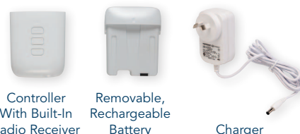
Controller With Built-In Radio Receiver Removable, Rechargeable Battery Charger

The PowerSmart™ system includes a controller, removable battery and PowerSmart™ charger.