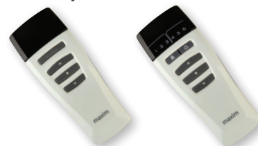
1 Channel Transmitter 6 Channel Transmitter

The PowerSmart™ system incorporates a built-in radio receiver that is compatible with the CW Maxim Radio Transmitter and is available in both 1 Channel and 6 Channel options. Both transmitters are powered by a 3 Volt Lithium button battery.